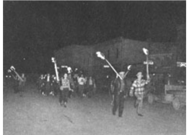
Torchlight parade in Arco

When local leaders heard that the AEC had smiled on Idaho by answering in the positive – yes, it would locate its "atomic plant" in eastern Idaho – there was dancing in the streets. Tiny Arco, the nearest community to the desert site of the new project, held a torchlight parade led by the high school band, followed by a celebratory dance in the recreation hall.