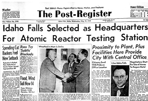
When the Atomic Energy Commission announced it had chosen Idaho Falls as its 'headquarters city' on May 18, 1949, The Post-Register trumpeted the news on its front page.

In a front-page editorial, the paper stated: "This is a proud moment in Idaho Falls' history. The decision of the atomic energy commission to locate its headquarters in this city provides us with almost unlimited opportunity in the future. It may well prove the spring board that will project this already thriving metropolis into a top spot in the economic development of the west."